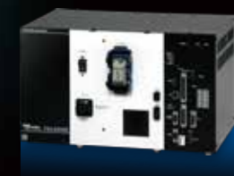
For TVM Series Controller